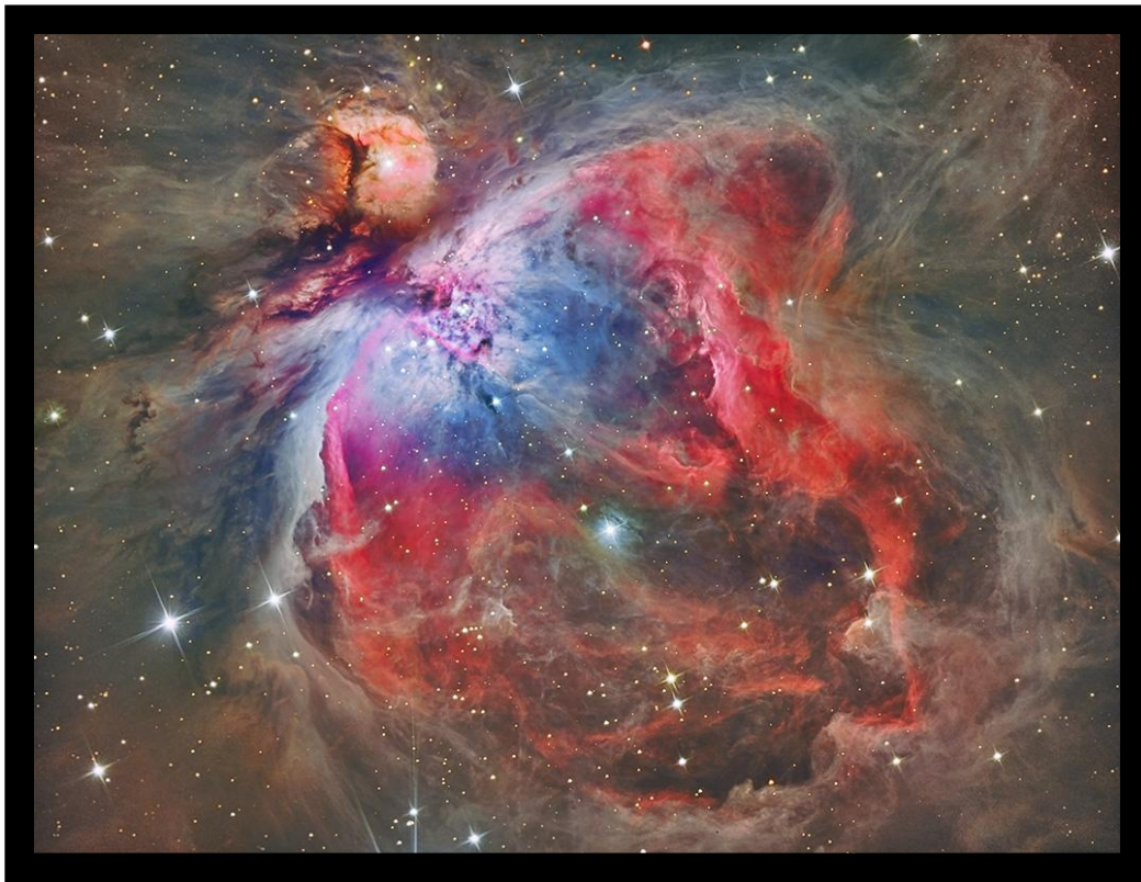
The Orion Nebula

The SCAS STAR ACADEMY has been approved and scheduled through May 2015 at the Robert Ferguson Observatory.