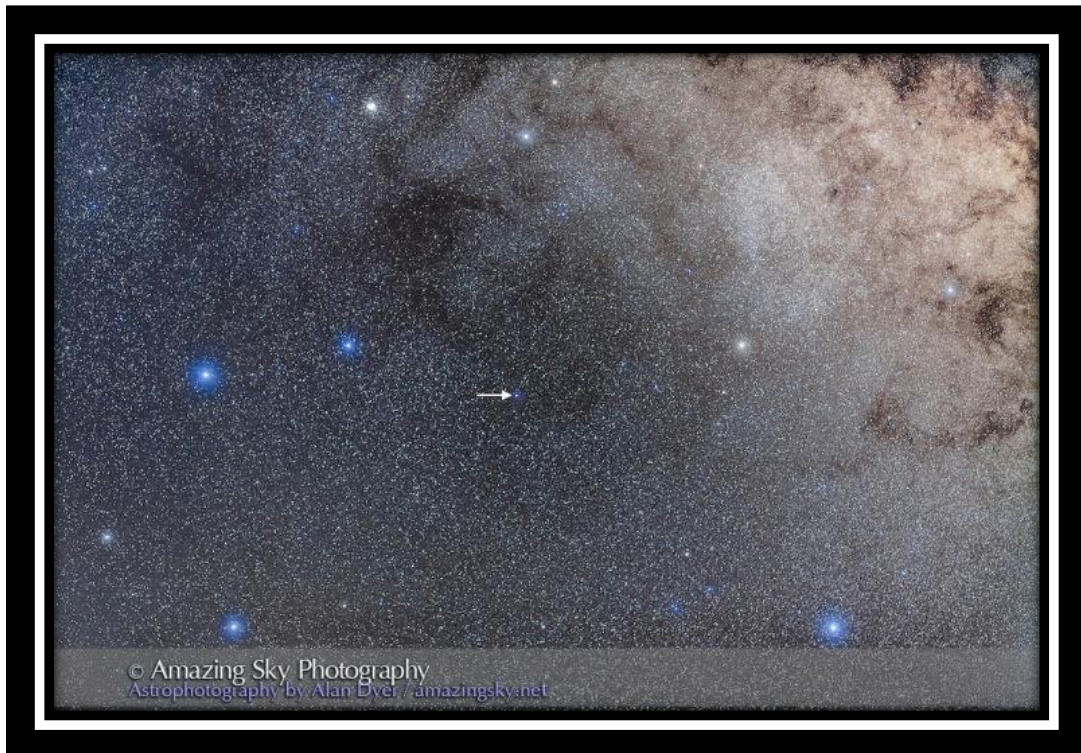
Nova Sagittarii 2015